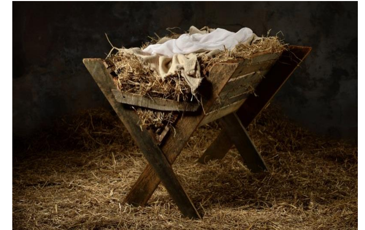
"One Mystery of Jesus' Birth"

Bringing God's Word to life, passionately serving Jesus Christ, each other, and the community